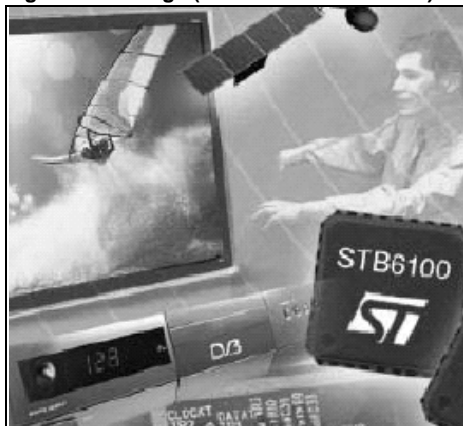
Figure 2. Integrated silicon tuner

Figure 1. Package (420 + 36 PBGA 27 x 27)