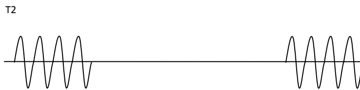
Fig : 1(c) (Simple Sine wave )